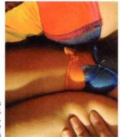
Rubber Layers 2021 Digital photography series