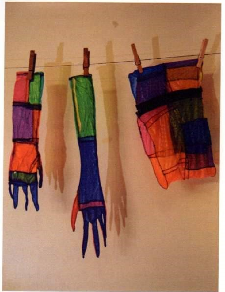
Left: "The bra" fetish circus , 2022 Detail shot Top right: fetish circus , 2022 Installation view Bottom right: Intimate wear , 2021 Installation view